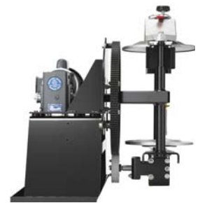
5025 Red D Mix Direct-Drive Gear System