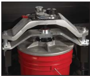
The 5025 Red D Mix one-step clamping system