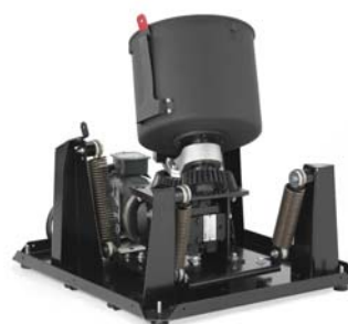
The Speed Demon 5's suspension system