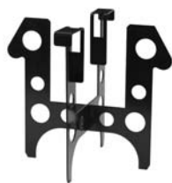
One Gallon Adapter for mixing round or square one gallon containers (sold separately)